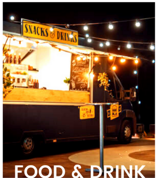
FOOD & DRINK