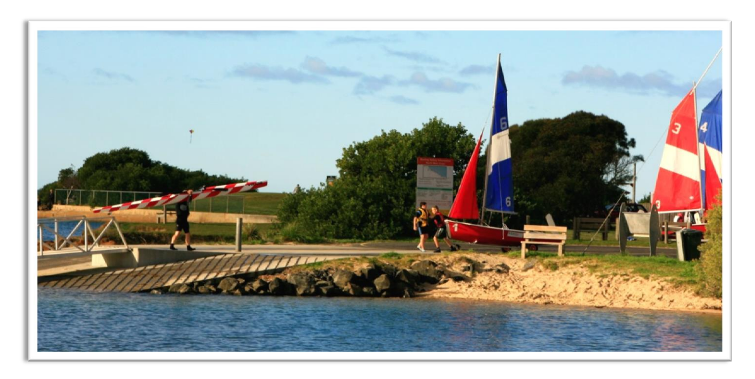
Outcome: 3.4 Diverse land users co-exist in harmony