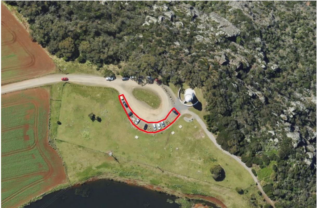
Attachment 12 – Sisters Beach Boat Ramp Carpark, Sisters Beach 2 Mobile Food Vendors maximum