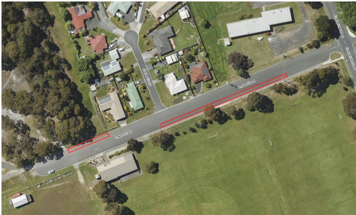
Attachment 6 – Somerset Foreshore Carpark (1), Somerset 2 Mobile Food Vendors maximum