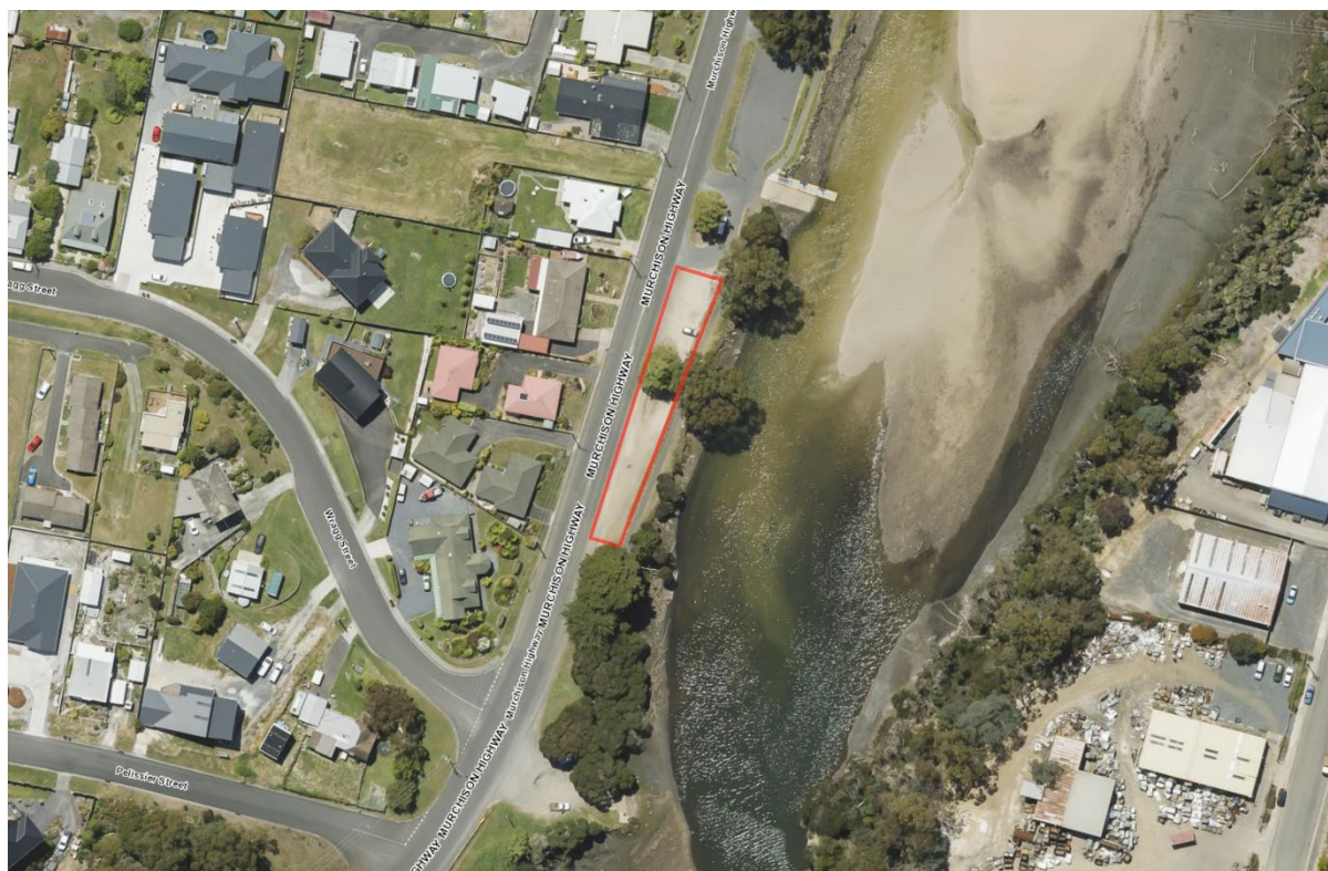
Attachment 10 – Fairlands Drive, Somerset 2 Mobile Food Vendors maximum