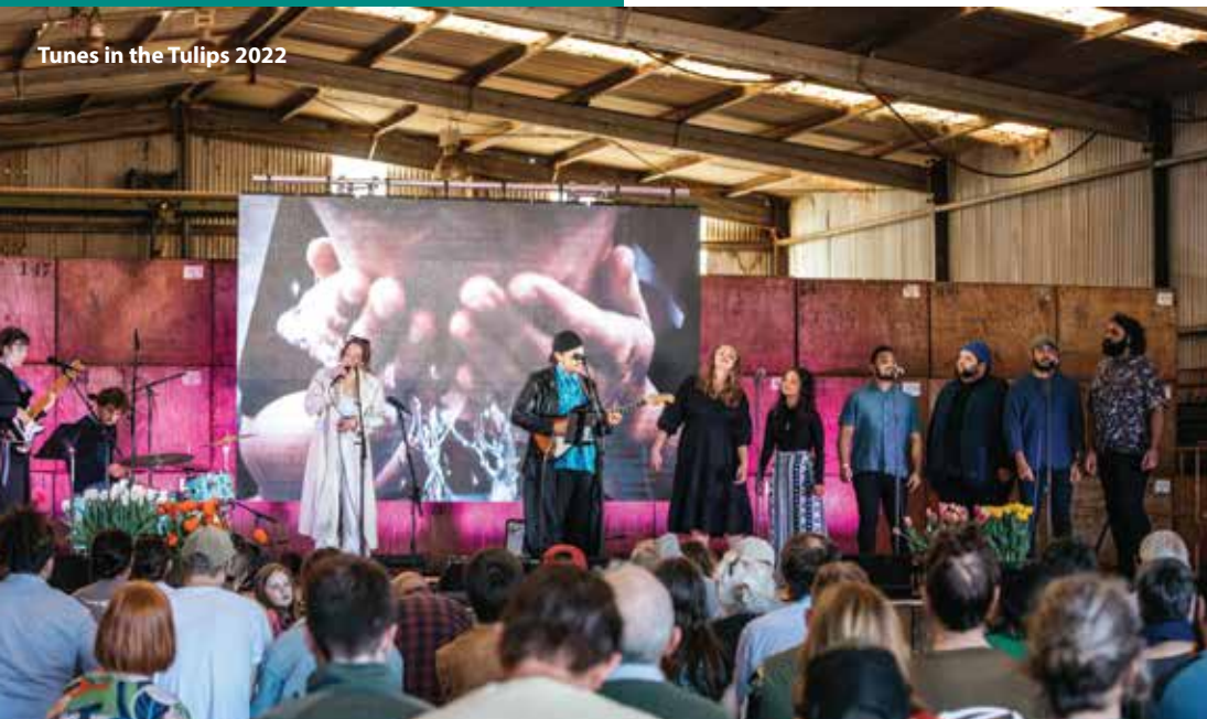
Tunes in the Tulips 2022